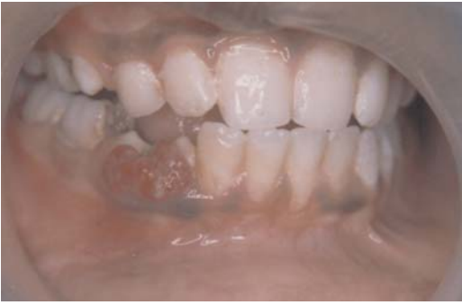
Figure 3 : Surgical excision